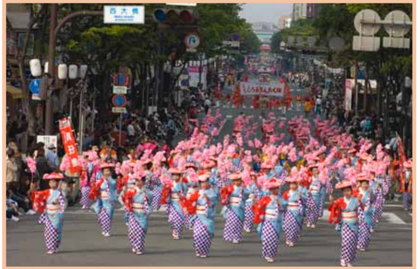
Fukuoka, Japan May 3 to 4 Hakata Dontaku Port Festival Location Fukuoka

Historical events in the background of Kanmon strait are vividly recreated during the festival. You can enjoy Japanese traditional culture and the mood of Shimonoseki through the Shimonoseki Strait Festival. 'Senteisai (先帝祭)' which praises Heike who lost the Dan-no-ura Battle and 'Genpei ship battle' where warriors on dozens of ships carrying red and white banners re-enact the great battle at that time, providing a great show.