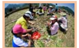
Namhae, Korea May 30 to June 2 Treasure Island Garlic Festival Location Treasure Island Garlic Town

Kite flying is a well-known event in the east sea of the Malaysian peninsula. People there carry the tradition of flying a kite named Wau Bulan which looks like the crescent moon. Wau Bulan is a symbolic shape of the pride of Malaysian people. It is even featured as the airline logo of Malaysia Airline System. Every May, kite lovers from all over the world gather at Tumpat and participate in a kite flying contest.