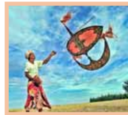
Kota Bahr, Malaysia May 28 to June 1 Kelantan International Kite Festival Location Tumpat, Geting Beach

Kite flying is a well-known event in the east sea of the Malaysian peninsula. People there carry the tradition of flying a kite named Wau Bulan which looks like the crescent moon. Wau Bulan is a symbolic shape of the pride of Malaysian people. It is even featured as the airline logo of Malaysia Airline System. Every May, kite lovers from all over the world gather at Tumpat and participate in a kite flying contest.