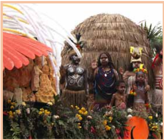
Surabaya, Indonesia March 5 Cultural and Flower Parade Location The Hero Monument, Surabaya City Hall

Around two million people visit the Hakata Dontaku Port festival, which is the signature event to celebrate the arrival of spring. The festival originated from 'Hakata Matsu-bayashi.' Dontaku Parade, where people march 1,230 meters from the Gofuku Station intersection to the Tenjin intersection by beating spatulas and dancing, is the highlight of the festival.