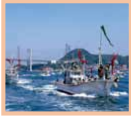
Shimonoseki, Japan May 3 to 4 The Shimonoseki Strait Festival Location Shimonoseki Kanmon Strait

If you want to see the beauty of Hanji in all its splendor, you have to see the Jeonju Hanji Culture Festival. The festival starts with 'The National Hanji Crafts Contest' and you can see the works of the previous contest winners. Designs judged on popularity and commercial value grab audience attention at the Hanji fashion show. There are various hands-on experience programs such as Hanji-making with a Hanji master. This is a good chance to observe the craftsmanship that goes into creating Hanji.