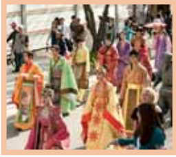
Jeonju, Korea May 2 to 5 Jeonju Hanji Culture Festival Location Jeonju Traditional Culture Center

If you want to see the beauty of Hanji in all its splendor, you have to see the Jeonju Hanji Culture Festival. The festival starts with 'The National Hanji Crafts Contest' and you can see the works of the previous contest winners. Designs judged on popularity and commercial value grab audience attention at the Hanji fashion show. There are various hands-on experience programs such as Hanji-making with a Hanji master. This is a good chance to observe the craftsmanship that goes into creating Hanji.