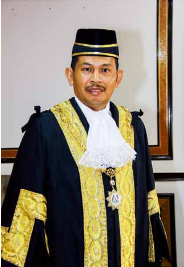
Dato' Zamri Bin Man Mayor of Ipoh City