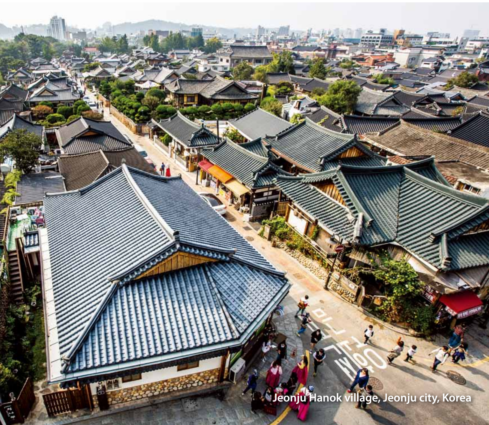
Jeonju Hanok village, Jeonju city, Korea

The Official Magazine of the Tourism Promotion Organization for Asia Pacific Cities