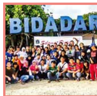
Jakarta, Indonesia | 2016. 4