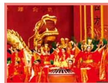
Zhengzhou, China | 2016. 4. 9